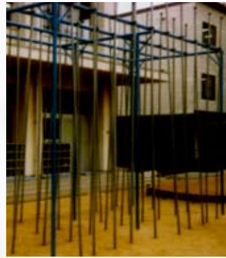
Picture of a Japanese playground game